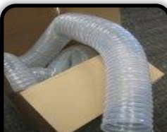
Hoses & Fittings